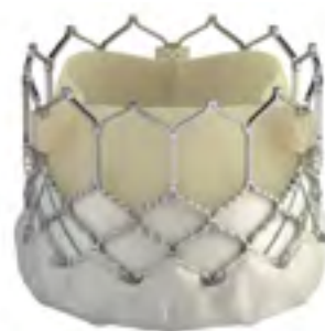
The Edwards-Sapien 3 valve

Preliminary tests are carried out before the procedure, including an electrocardiogram, a chest x-ray, and a CT coronary angiogram, the aim of which is to ascertain the feasibility of this technique, as well as determine the best approach and the size of valve to be implanted.