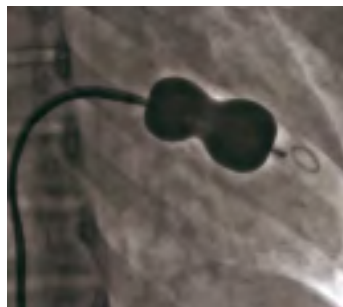
Mitral valve dilatation

In cases of mitral stenosis following acute rheumatic heart disease (RHD) in young patients, with a flexible valve and with regular sinus rhythms a percutaneous mitral valvuloplasty can sometimes postpone surgery for several years. Conditions treated with this approach must fulfil very specific and limited criteria.